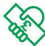
Table 1 shows the full-time equivalent annual or hourly pay rate of selected job roles in Leicestershire (area), East Midlands (region) and England.

All figures represent the independent sector as at March 2023, except social workers which represent the local authority sector as at September 2022. At the time of analysis, the National Living Wage was £9.50.